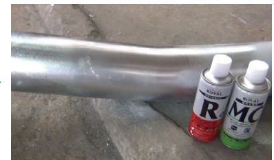
Apply ROVAL MC for color matching