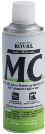
ROVAL MC Color Matching Metallic Spray for Galvanized materials

ROVAL MC Color Matching Metallic Spray for Galvanized materials, which is ideal for color matching after hot-dip galvanization and for hiding blemishes or ROVAL repairs.