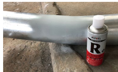
Repair with ROVAL